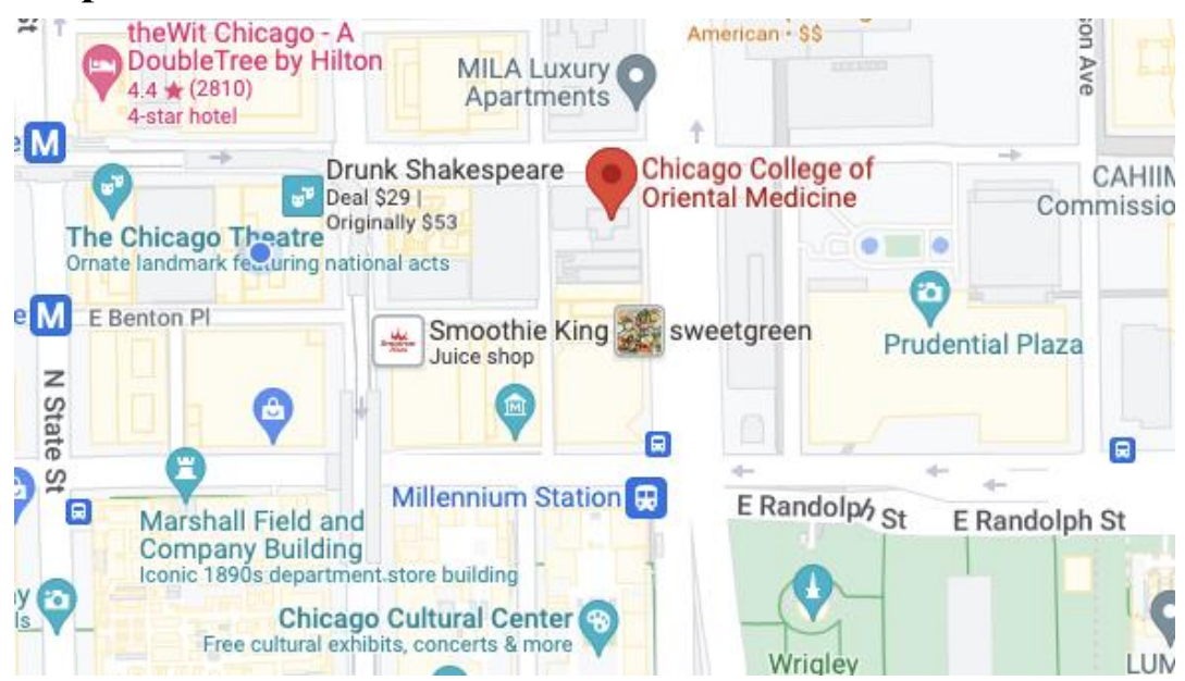
180 North Michigan Avenue, Suite 1919, Chicago, Illinois 60601